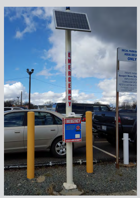
Photo of the emergency call box located at 45th St. between Huntington and Warwick Blvd.