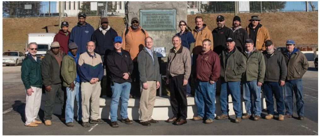
Pictured: X67 mechanical, electrical and structural inspection teams were recognized by NNS leadership for working safe and promoting safety at work for the past six years.