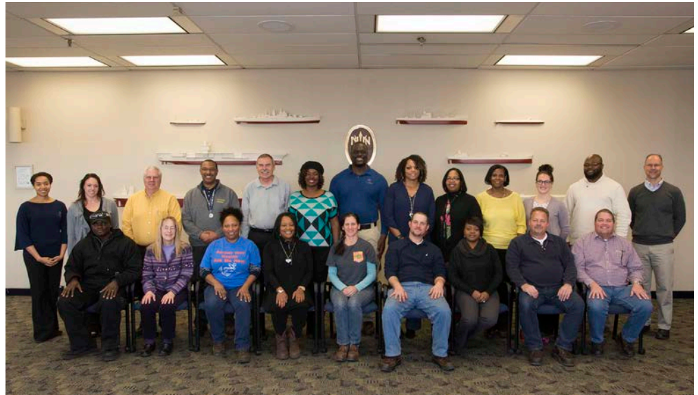
NNS' Wellness Champions were recognized at an appreciation luncheon Jan. 20.