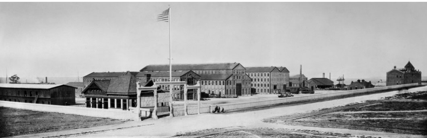
▲ The shipyard's main gate on Washington Avenue in 1892. Operation of electric cars between Newport New and Hampton began Dec. 24, 1892.

MOTORCYCLES - Wanted British motorcycles, basket cases, parts. Also any pre 1980 motorcycle of any type. Cash paid (757) 620-4475