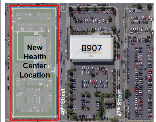
Aerial view of the location of NNS' new family health center.

The HII Family Health Center at Newport News Shipbuilding is one of two new centers opening for eligible HII employees. A second family health center will be opened in Gautier, Miss., for employees and dependents of the company's Ingalls Shipbuilding division. The centers are part of HII's larger benefits strategy designed to engage employees and their families in their own health and wellness and make quality health care more accessible. The strategy also includes the recent addition of Teladoc, a program where employees can consult with board-certified physicians on non-emergency medical issues via telephone, mobile application or computer. Additionally, HII offers a preferred rate for health care insurance to eligible employees who have completed a tobacco-cessation program or attest they do not use tobacco.