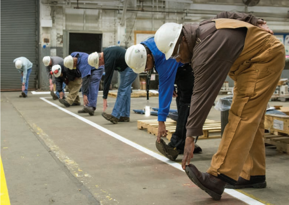
Main Machine Shop Assembly team stretches before beginning work Jan. 11.

A weekly publication of Newport News Shipbuilding