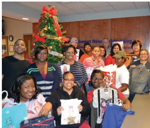
Members of HOLA and Jaycees donated gifts during the holidays to sponsor eight children in the local community.